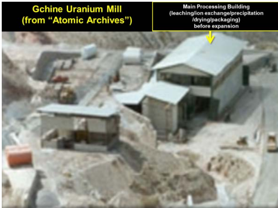
Figure 5. An image from the Atomic Archive showing the main processing building at the Gchine uranium mill before it was expanded.