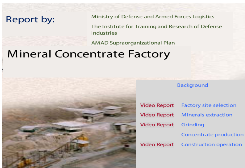
Figure 8. Title page of Iranian presentation on Gchine in Farsi (top) and translation by professional translation service (bottom) shows an image of the Gchine site on the cover of a report prepared under the the AMAD Supraorganizational Plan of MODAFL's Institute for Training and Research of Defense Industries. This institute is also known as the Defense Industries Training and Research Institute or Training and Research Institute of Defense Industries.