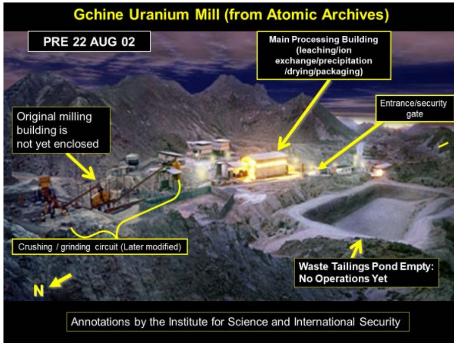
Figure 2. The Gchine yellowcake production plant, or mill, as seen in a photo discovered in the Iran Atomic or Nuclear Archive.