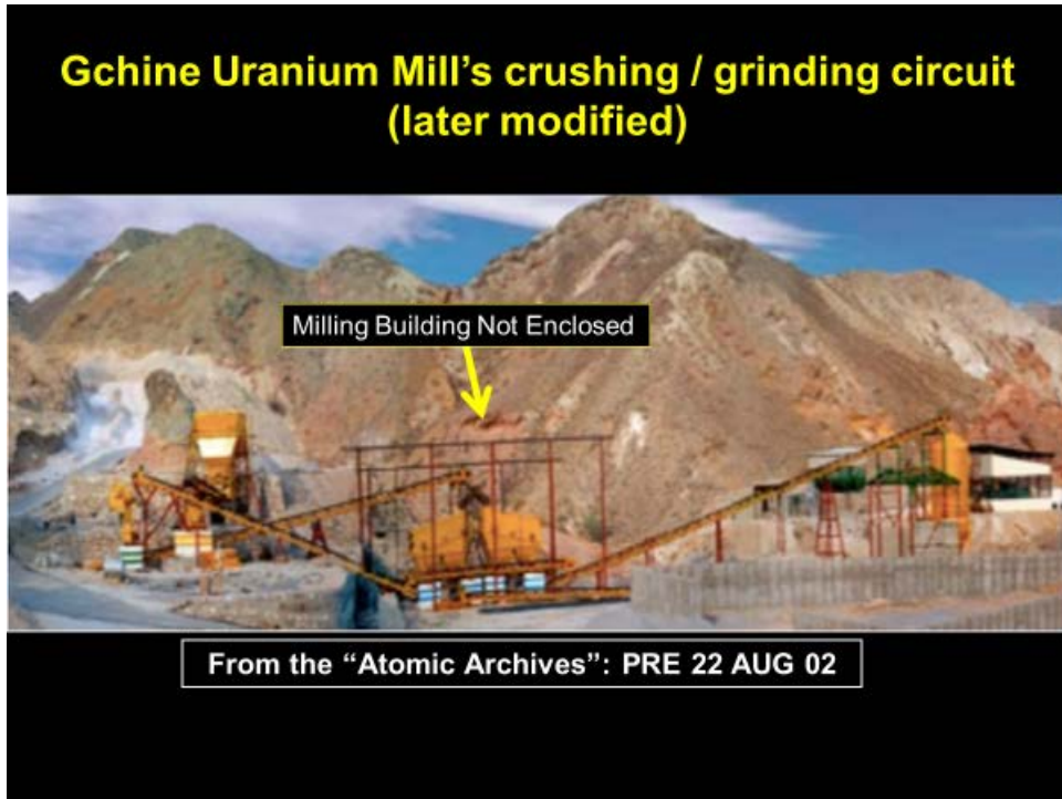
Figure 4. A close-up image from the Nuclear or Atomic Archive showing the milling building before it was enclosed.