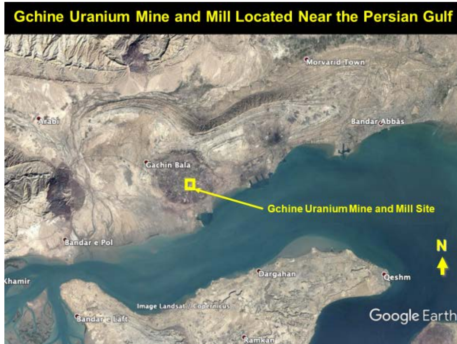
Figure 1. Gchine uranium mine and yellowcake production plant, or mill, in southern Iran.

Secretary of the Supreme National Security Council of Iran and now President of Iran. 2 Rouhani, importantly, also expressed Iran’s readiness to act “with a policy of full transparency.” 3 The transparency policy was included at the IAEA’s insistence in October 2003, and just prior to Iran’s provisional implementation of the Additional Protocol in December 2003, because uranium mining is not subject to the comprehensive safeguards agreement, e.g. the agreement does not require Iran to provide a full history of the operations of uranium mines and mills in its initial declaration to the IAEA. But the special transparency policy undertaken by Iran would apply to uranium mining and milling activities.