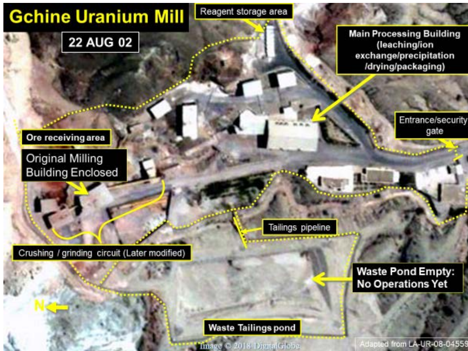
Figure 3. A commercial satellite image of the Gchine uranium mill on August 22, 2002.